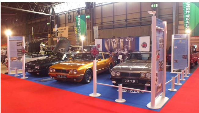
All of This ..... Fits in This! (Minus the Cars of Course!)