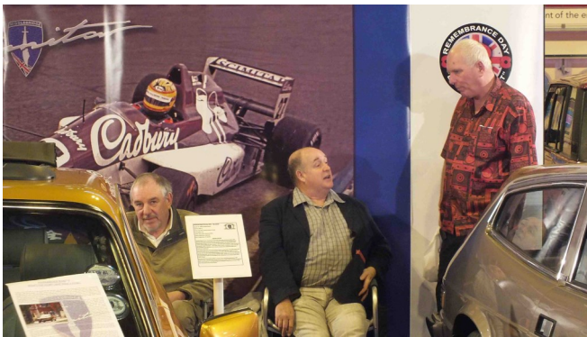
'Ello, Ello, Ello - What 'Ave We 'Ere Then?