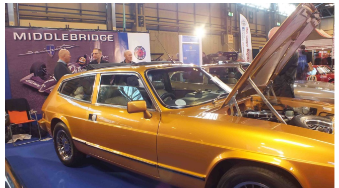
Plenty Questions Asked and Leaflets Taken