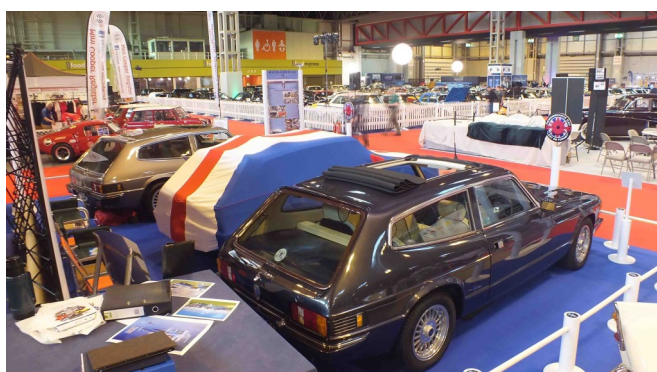
Friday Morning Before Doors Open