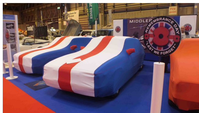
The Cars as Covered During the Two Minute Silences on Friday and Sunday