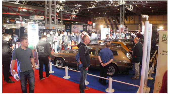
A Very Busy Three Days!