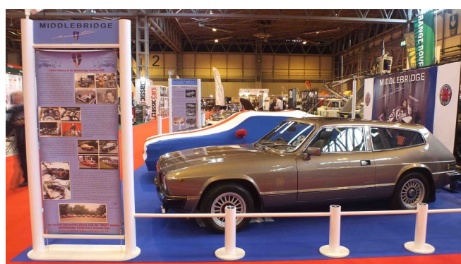
Bruce's fantastic stand!